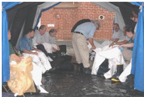
Team members suit up in their PPE before getting safety checked and starting decon

All guests and new team members were also provided with a tour and familiarization of the University of Tennessee Anthropology Forensic Facility (the “Body Farm”).