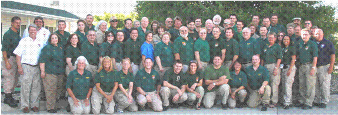
Region VII team members gather for a group picture